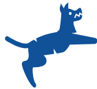
Dog Bites/ Animal Attacks