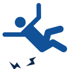
Slip & Fall